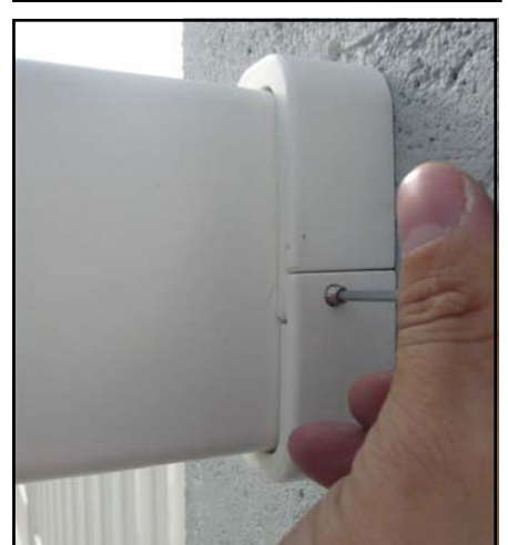
Attach the Rail using the hollow hex screws M5x8, until pressurized. These screws enable the support to be locked in place.