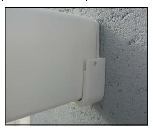
Insert the 2 supports of the top part onto the Rail. If necessary, use a plastic mallet to ensure the holes are aligned.

Insert the Rail in the supports of the bottom part.